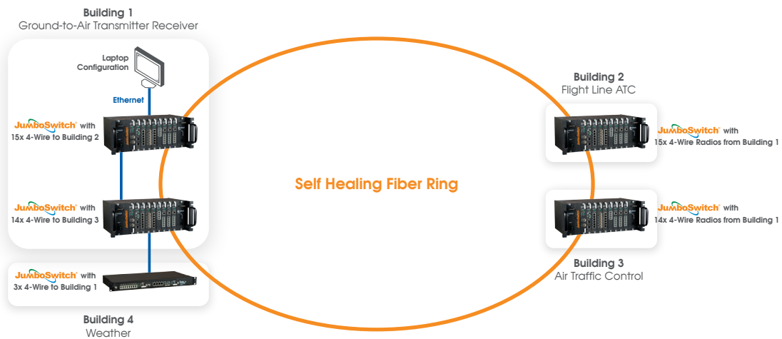
Above: The JumboSwitch platform migrates the entire airfield to a fiber backbone, including radio communications, command post weather, air traffic control, ground to air transmit/receive (GATR) and the tower.