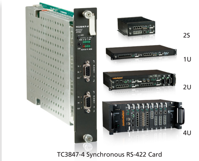
TC3847-4 Synchronous RS-422 Card

The TC3847-4 links or extends up to 2 channels of synchronous RS-422 serial across Layer 2/3 Ethernet/IP, CE, or MPLS networks. It is easy to configure, offers extremely low latency, and supports point-to-point and point-to-multipoint topologies.