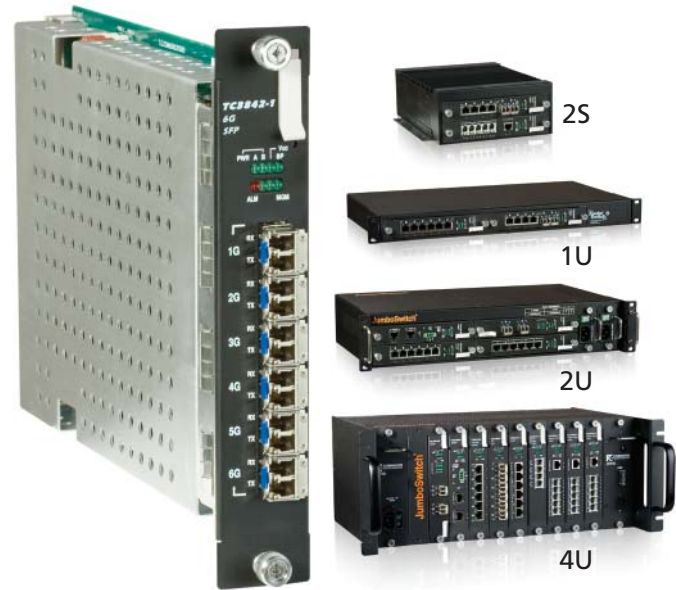
TC3842 with Various JumboSwitch Chassis & Cards Cages

F eaturing a wide range of advanced networking features, the TC3842 is a 6-Port SFP Gigabit Ethernet Switch. It is compatible with both SFP optical and copper modules and supports 850nm multimode and 1300/1550 single mode. Three versions are available: