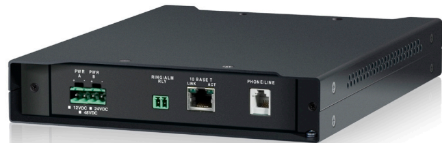
TC1910S Standalone Unit Rear

The TC1910 Ethernet Telephone/Analog Extender enables telephone service over a LAN via 10Base-T Ethernet connections. It has a built-in Codec that digitizes voice and converts to packets for transmission between local and remote TC1910s with designated IP addresses. It is compatible with PBX and Key Systems (POTS).