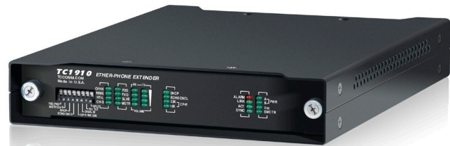
TC1910S Standalone Unit Front