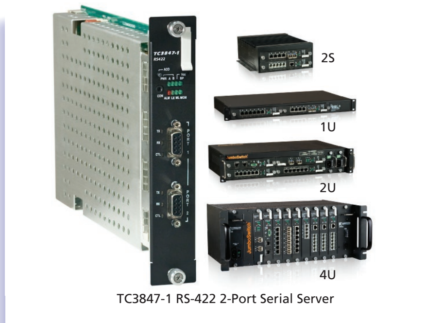
TC3847-1 RS-422 2-Port Serial Server

C ompact and simple to configure, the TC3847-1 Serial Server transports two channels of RS-422 data over existing Layer 2/Layer 3 networks.