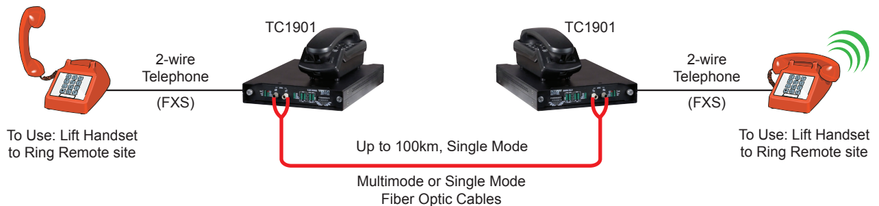
Typical Application Using TC1901s to Establish a "Hot Link" via Fiber Optic Cables