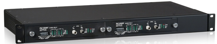
2 X TC1901 (Housed in TCRM195 19" Rack mount Card Cage)

The TC1901 "Quick-Talk" Telephone/Analog Fiber Extender can turn a fiber optic network into a voice network simply by plugging a telephone set into an RJ-11 connector. It is compatible with most 2-wire analog PBXs or Key Systems.