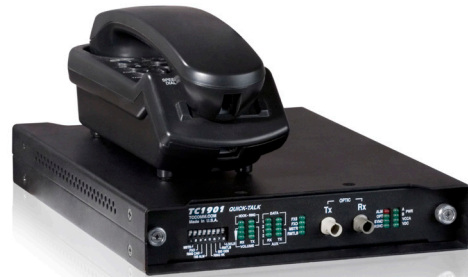
TC1901S Standalone/Wallmount Unit (Telephone set sold separately)