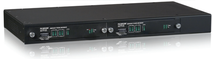
TC8938R (Housed in TCRM195 19" Rackmount Card Cage)

D esigned specifically for emergency phone line applications, the TC8938-1/-2 receives and broadcasts a 2-wire analog POTS signal to up to 7 remote phones. The initiator of the call can have a conversation with up to 7 remote users on the same phone line.