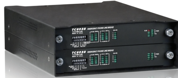
TC8938S Standalone/Wallmount Unit