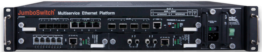
JumboSwitch® 10G Multi-Service Ethernet Platform Front View