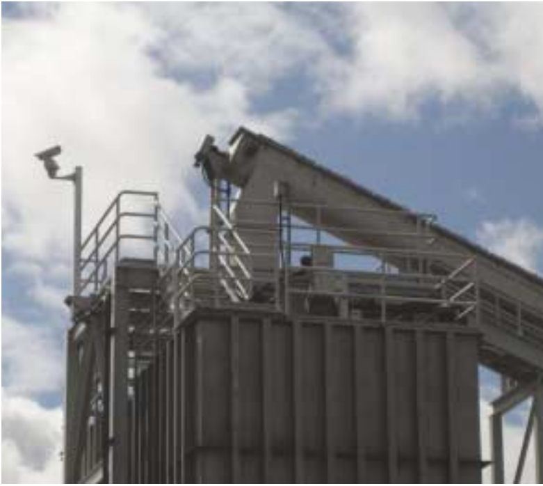
“PTZ” cameras are used for surveillance.

fectly and we didn’t look back.” (Note: the 1300nm multimode long distance TC3820’s support distances up to 2 km over 50/125 or 62.5/125 multimode fiber.)