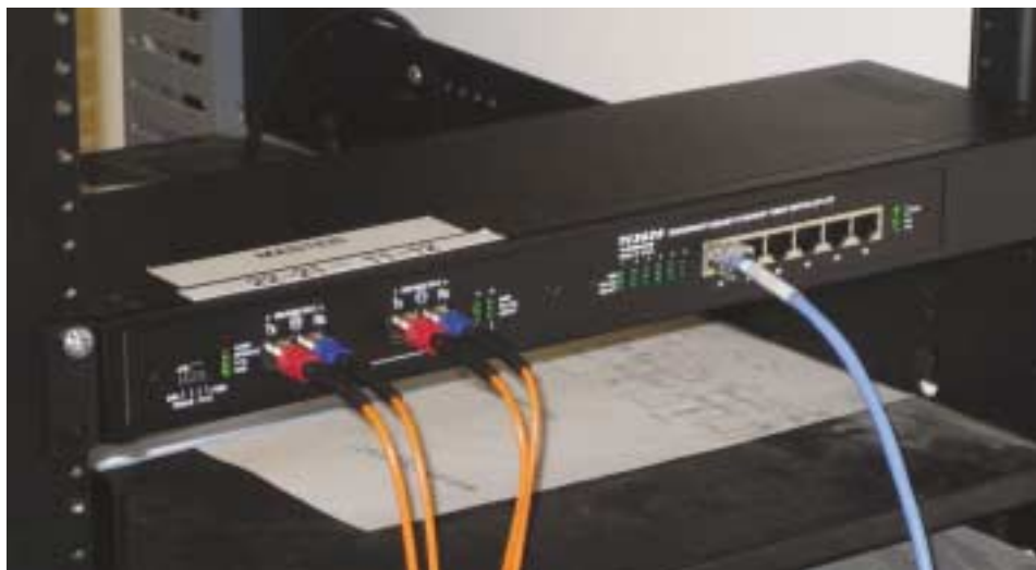
TC3820 with 1300nm redundant optics

process required considerably more bandwidth than originally anticipated during design. The process screens that were developed contained more dynamic data and symbols as the operations staff determined their process control needs.