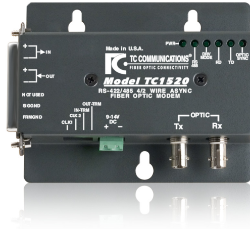
(Wallmount Base Unit shown)

Versatile and competitively priced, the TC1520 fiber optic modem supports RS-422 and 2-wire or 4-wire RS-485 interfaces. It transmits asynchronous data at speeds up to 500 Kbps.* Distances up to 80km are possible over single mode fiber, 4km over multimode fiber.