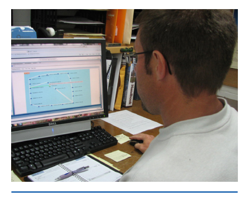
In addition to monitoring network performance, the TCView® NMS includes features such as "Unit Discovery" to streamline building system networks.

"One of the biggest benefits has been how easy it now is to 'plug and play' out in the field," said Keith. "Today, a tech can call up any site from his desk. No more 2 ½ hour drives out to J8 (substation)."