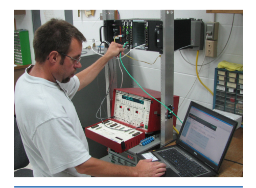
NIPCO Technicians only require a laptop to perform JumboSwitch network health/alarm checks or reconfigurations.

Driven by the need to deliver hydro power from the Missouri River dams, Northwest Iowa Power Cooperative was formed in 1949 by the rural electric cooperatives. NIPCO and its member cooperatives serve the electric needs of homes, farms, communities, business and industry in 13 counties of western Iowa.