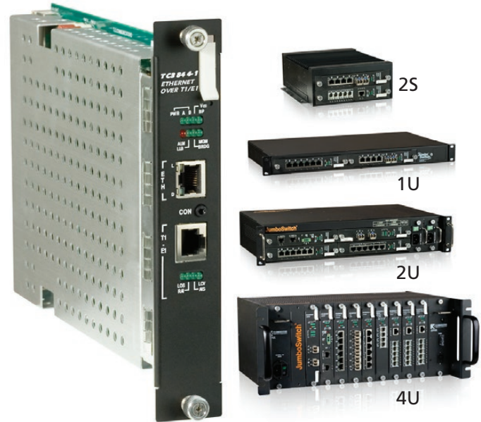
TC3844-1 - IP-over-T1/E1 Gateway

The TC3844-1 Ethernet-over-T1/E1 Gateway allows the user to extend Ethernet backhaul applications to remote locations over existing TDM Telecom infrastructure. It converts the Ethernet data into framed or unframed T1/E1 format for transmission over T1/E1 links, and the modules are used in pairs.