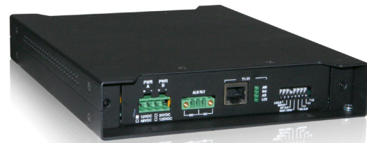
TC8616S Rear Panel

The TC8616 is a one or two channel C37.94-over-T1/E1 multiplexer. For T1 Channel 1 supports N=1 to 12 and Channel 2 support N=1 to 8. For E1 both channels support N=1 to 12. This allows network managers the flexibility to leverage existing T1/E1 circuits by adding teleprotection relays. It is economical, simple to install and comes standard with built-in power redundancy.