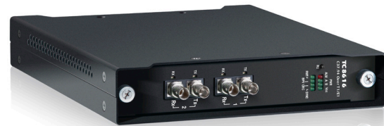
TC8616S Front Panel