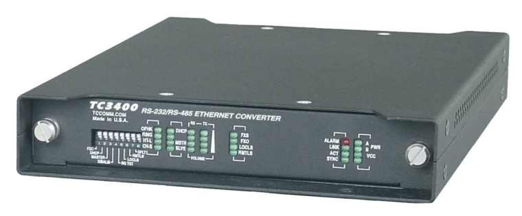
TC3420 "Ethernet Converter Multi-Poll"